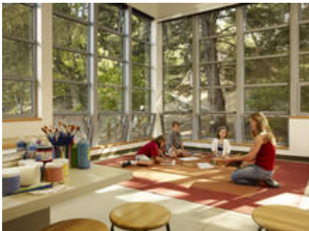
Clerestory monitor provides daylight and natural ventilation.

A key goal of the project was to provide excellent daylighting to every space. The building footprint is narrow, much of it single loaded, to allow adequate side-lighting for most spaces. This massing is supplemented by skylights over the teaching wall in the classrooms and a large clerestory running down the center of the library to wash these internal areas with daylight. The high percentage of spaces near the perimeter—due to the narrow building footprint—also facilitate natural ventilation and user control.