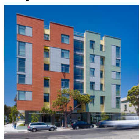
Merritt Crossing Senior Apartments - Photo Credit: Tim Griffith

Located at the edge of Oakland's Chinatown, this new affordable senior housing transforms an abandoned site near a busy freeway into a community asset for disadvantaged or formerly homeless seniors while setting a high standard for sustainable and universal design.