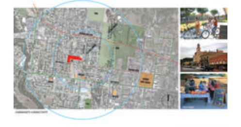
Community Connectivity

The project provides a model for community connectivity of diverse populations at the local scale, while offering a replicable solution to the growing housing crisis for adults with autism at the national scale.