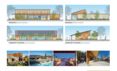
Building Elevations - simple building forms, materials and colors create a calm community environment