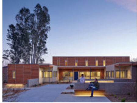
Entry Courtyard At Residence - Photo Credit: Tim Griffith

Sweetwater Spectrum is a new national model for supportive housing for adults with autism, offering life with purpose and dignity. Created to address a growing housing crisis for adults with autism, this new community for sixteen residents integrates autism spectrum design, universal design, and sustainable design strategies.