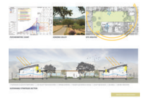
Psychrometric Chart, Site Analysis and Sustainable Strategies Section - Photo Credit: LMS Architects

The site is located in the warm, marine climate of the Northern California inland coastal region. The buildings are sited to optimize the passive benefits of daylighting, solar control, natural ventilation and cooling, and outdoor living. Due to the sensory sensitivity of the residents, climate control and comfort were critical aspects of the design. In addition to passive strategies the building envelopes were optimized to reduce energy loads through high-performance windows and enhanced building insulation.