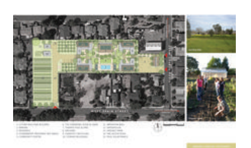
Site Plan for Sweetwater Spectrum Community & Farm - Photo Credit: LMS Architects + Deirdre Sheerin