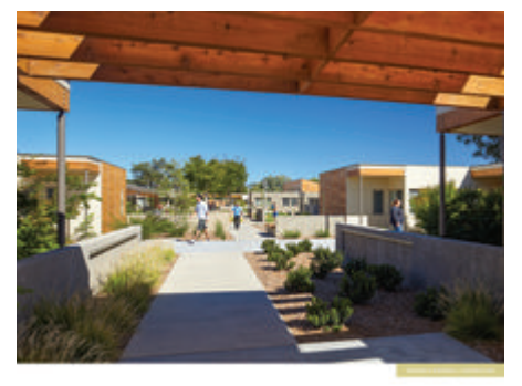
West Entry Threshold from the farm looking towards the Commons

The materials and construction systems of the Sweetwater Spectrum Community were selected with special consideration toward health, resource-efficiency, and the specific needs of the residents. Individuals with autism spectrum disorder can experience heightened sensitivity to a variety of environmental factors, including visual, thermal, auditory, social, and