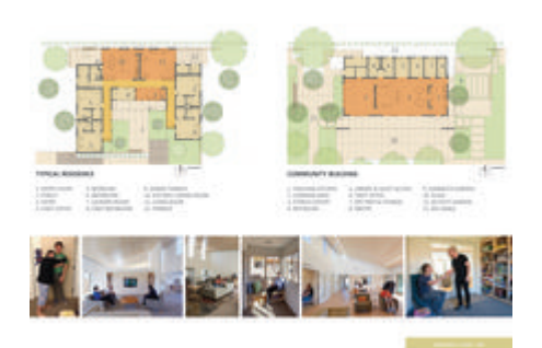
Residence and Community Building Plans - Each space has a balance of daylight and natural ventilation. - Photo Credit: Tim Griffith, Winni Wintermeyer, LMS Architects

The design emphasizes simple solutions that maximize energy efficiency, resident comfort, and connections to nature while reducing first cost and long-term maintenance.