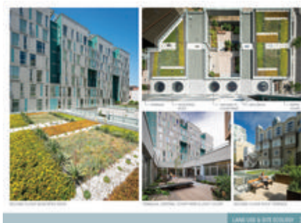
Measure 3 - Second Image - Photo Credit: Patrik Argast + Tim Griffith

Located in a very urban setting near downtown San Francisco, the Transbay redevelopment plan will introduce a new ecology to this former commercial district impacted by freeway off-ramps. New parks, landscaped plazas, and green roofs will transform the area. Surrounding the RCA site, a new under-ramp park will provide recreational and landscape features.