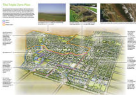
Long Range Plan at Buildout - Photo Credit: UC Merced

The plan is based on a compact orthogonal grid that evokes classic Central Valley downtowns, promotes efficient land use, and is oriented to maximize rooftop solar collection. Within the grid, landscape design applies a low-water typology that is contextual and includes tree and shrub selections intentionally designed to attract native birds and other wildlife.