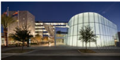
View looking at council chambers and office tower from southeast