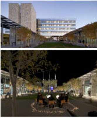
Views of civic center courtyard that acts as the community living room

The pre-development condition of the site was underutilized, consisting of abandoned structures, deteriorating parking lots and inappropriate zoning of activities. A majority of the site includes extensive parking lots and very little landscaping. Historical records indicate greater development density, but many of those structures had been removed. Although the site was not considered a brownfield, there were abandoned underground fuel storage tanks from a past service station that were removed, and the soil contamination was remediated.