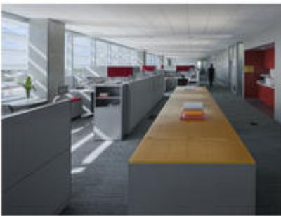
Open flexible office environment

One of the most important design strategies of the project was to enhance the connections to the outdoors. This is accomplished in both the office tower and the single-story community service buildings that surround the site. The east–west orientation of the office tower allowed for opportunities to maximize exposure on the north and south. This, coupled with narrow floor plates and open, flexible planning, allows deep penetration of the daylight while maximizing views. The shade fins on the south also act as light shelves, bouncing light into the interior. The single-story buildings are open and transparent to the street frontages connecting to the public and community.