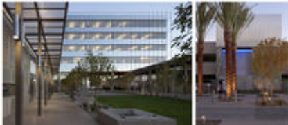
Views of courtyard and cooling tower water feature

As with any facility located in a desert region, water conservation is critical. The Chandler City Hall complex has taken a comprehensive approach to reducing potable water use. Both interior and exterior strategies were employed. The interior approach utilizes low-flow water-conserving fixtures, while the exterior approach utilizes high-efficiency drip irrigation and low-water-use native plants. The project also focused on the process side by capturing “blow-down” water from the operation of the cooling towers and the condensate water from the HVAC systems. Large volumes of water normally get dumped down the sewer when employing cooling towers. This water is non-chemically treated and reclaimed for the purpose of supplementing irrigation and waste conveyance. During the summer months, there is an excess of water generated, so no potable water is being used for interior or exterior systems. Less water is generated during the winter months, which requires some potable water.