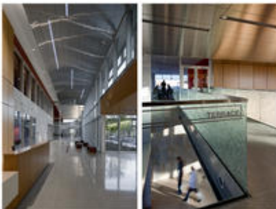
First level public lobby space and second level balcony - Photo Credit: SmithGroupJJR