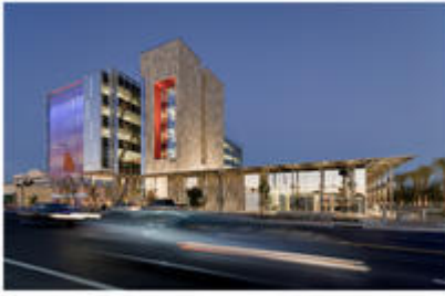
View of council chamber and courtyard at night