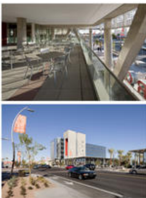
Views of open mezzanine and street frontage