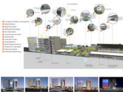
Overall sustainability diagram and images of “Turbulent Shade” Public Art

From an environmental and ecological standpoint, the design responds to the harsh desert climate and at the same time provides for appropriate outdoor spaces that introduced much-needed green space back to the heart of the downtown. Pushing the project footprint out to the site edges allowed for the design of a central courtyard that took advantage of shaded walkways and landscaping, channeling prevailing winds and evaporative cooling from a central water feature to temper the environment.