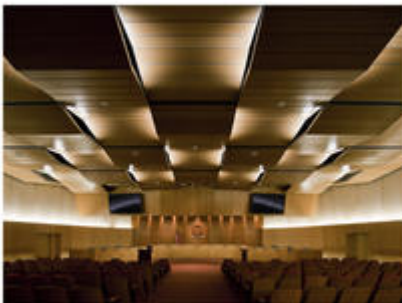
Council Chambers