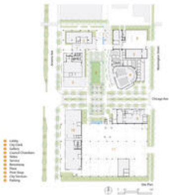
Site plan and first level -