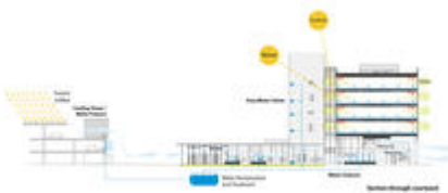
Building section and sustainable courtyard diagram

The City Hall is situated over two city blocks bisected by Chicago Avenue. The office building itself is situated at the northern boundary of the site and is lifted above the ground plane, creating a breezeway at the north end of the courtyard. These gaps between blocks at the