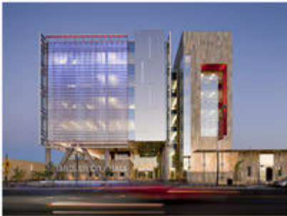
View of office tower from west - Photo Credit: SmithGroupJJR