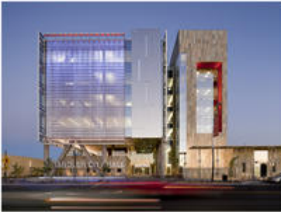
View of office tower from west

Chandler City Hall is a low- to mid-rise government complex developed on two city blocks and located with Arizona Avenue along its eastern edge and Washington Street as its western edge in downtown Chandler. The center of the development is bisected by Chicago Street. The north block is devoted to a 5-story office tower at the north end and one-story buildings along Arizona Ave and Washington Street. The tower houses City departments while the 1-story buildings contain an art gallery, council chambers and a television studio. The south block is devoted to one-story buildings and a 2-level parking structure. The buildings contain a neighborhood redevelopment office and a print center.