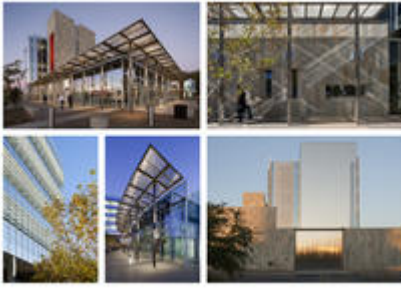
Collage of material images

The overall design and material selection embody both a reflection of the progressive nature of this knowledge community and a timelessness that respects the past. The single-story buildings are a modern interpretation of the regional historic vernacular that emphasized mass, punched window openings and shaded walkways. Stone was used to emphasize mass and be representative of a civic center aesthetic. Metal and glass were predominately used throughout the complex to express to the community, "We are about the future, and one of openness and transparency."