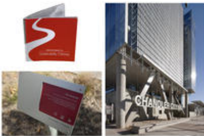
Images of “Sustainability Pathway” and “Turbulent Shade” façade system

A very accessible dialog of sustainability has been interwoven into the project through two key elements. A poet and graphic artist created the “Sustainable Pathway,” which provides visitors a self-guided tour of the building's sustainable elements marked by descriptive signs and noting whether the strategy is socially, economically or environmentally focused. A public artist created “Turbulent Shade,” an shading element that is very much connected to the physical environment by moving with the wind. Sustainability is on display for the community to interact with.