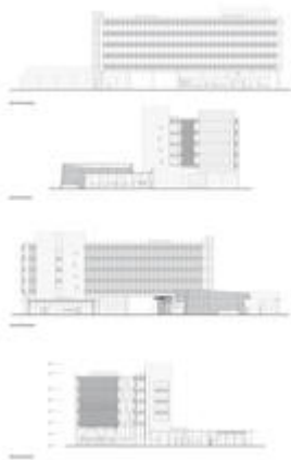
Elevations - Photo Credit: SmithGroupJJR